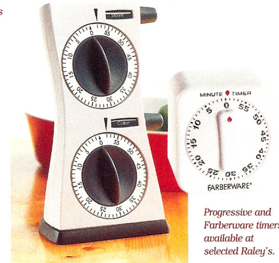
Progressive and Farberware timers available at selected Raley's.