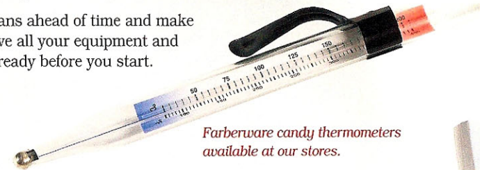
Farberware candy thermometers available at our stores.